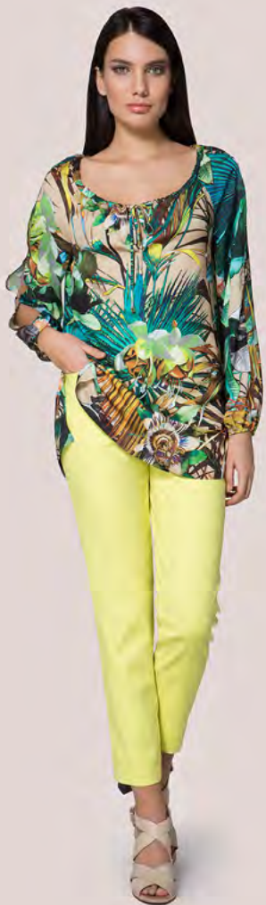
Tunic 16-738 • 26 Trousers 16-725 • 8