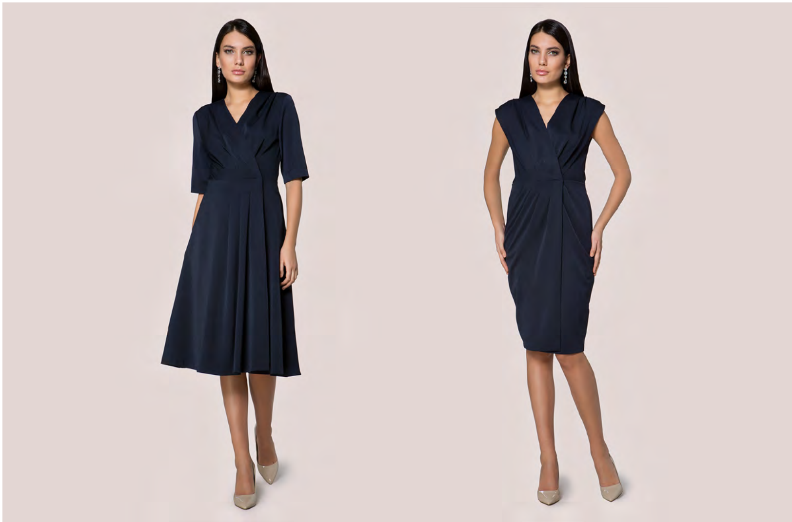
Dress | 16-705 • 13