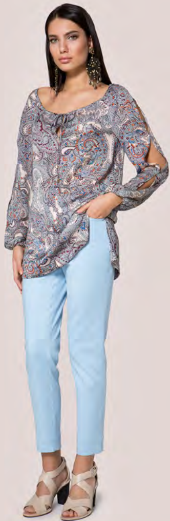
Tunic 16-738 • 25 Trousers 16-725 • 7