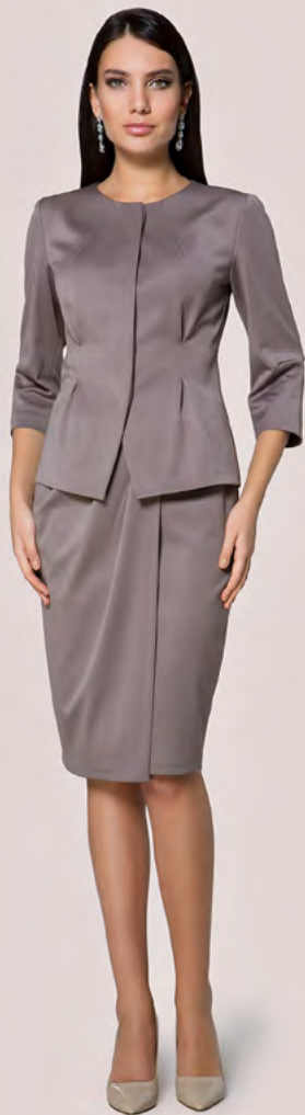
Jacket 16-754 • 12 Skirt 16-763 • 12