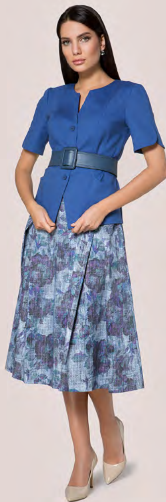
Jacket 16-722/2 • 6 Skirt 16-702 • 1