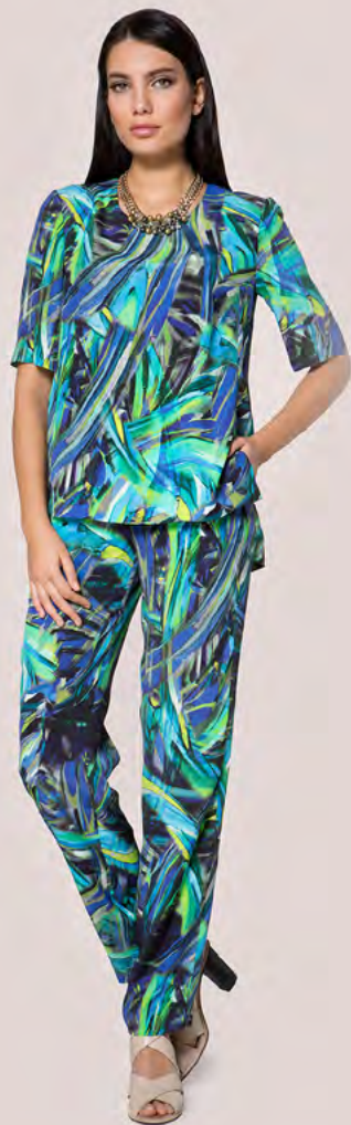
Tunic | 16-749 • 23 Trousers | 16-752 • 23