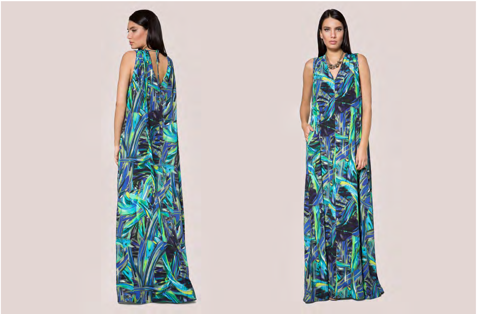
Dress | 16-767 • 23