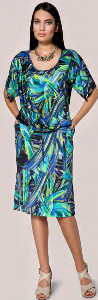
Blouse | 16-712 • 23 Skirt | 16-750 • 23