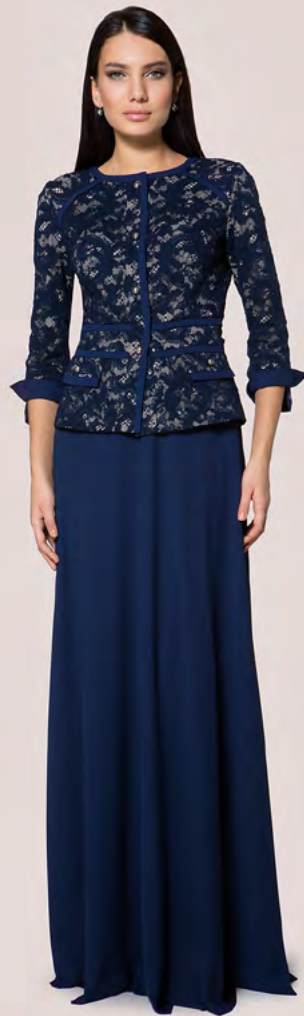
Jacket 16-744 • 29 Skirt 16-755/2 • 18