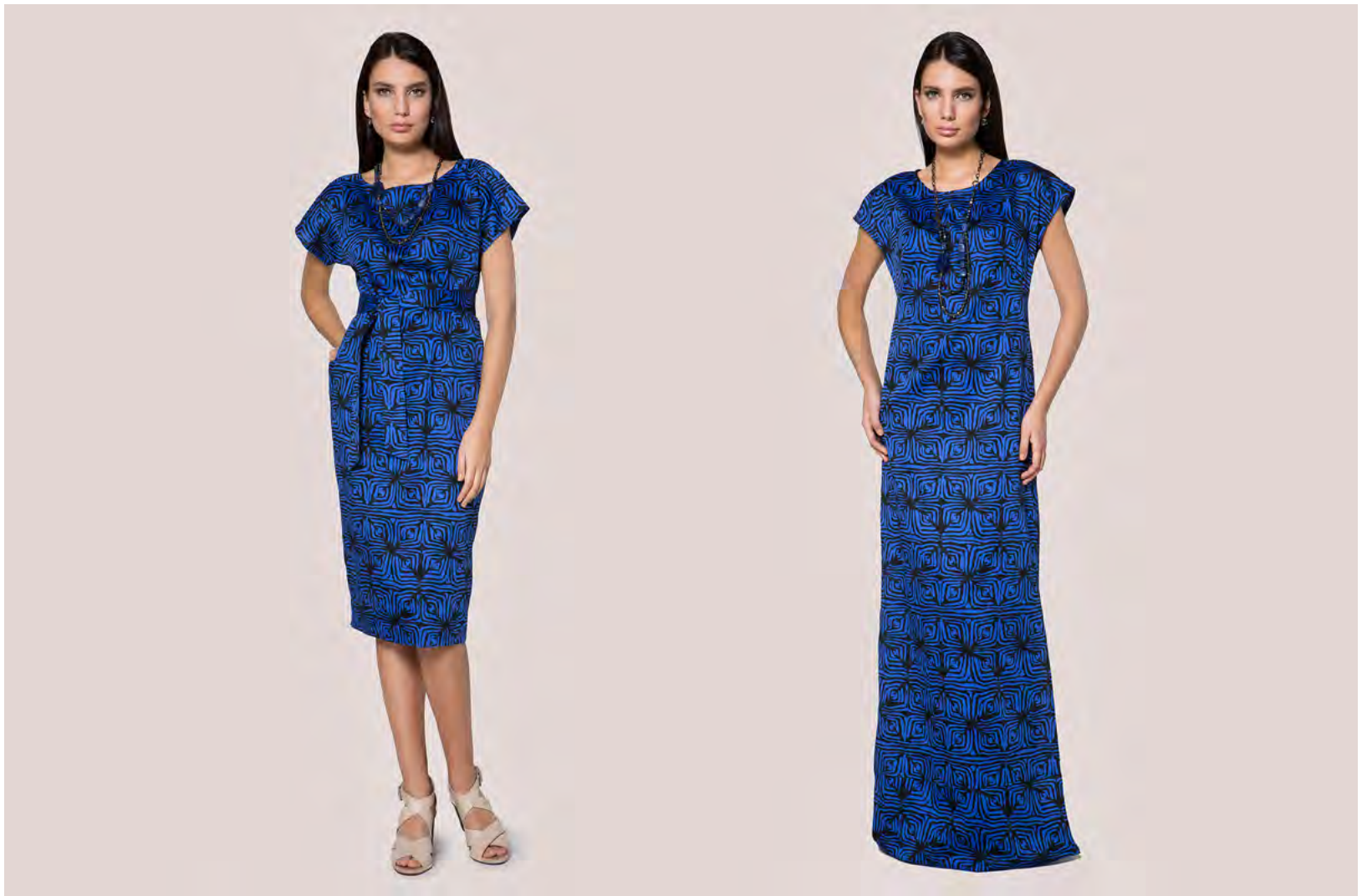
Dress | 16-731 • 37