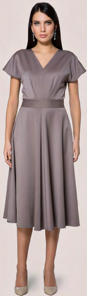
Dress | 16-706 • 12