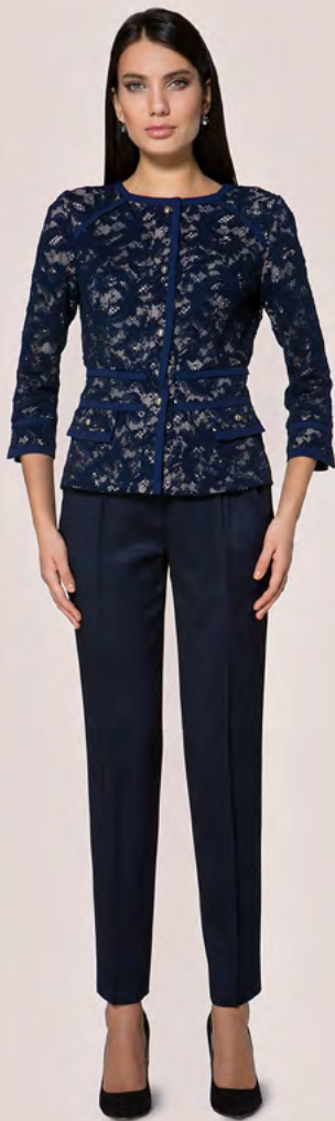
Jacket 16-744 • 29 Trousers 16-765 • 13