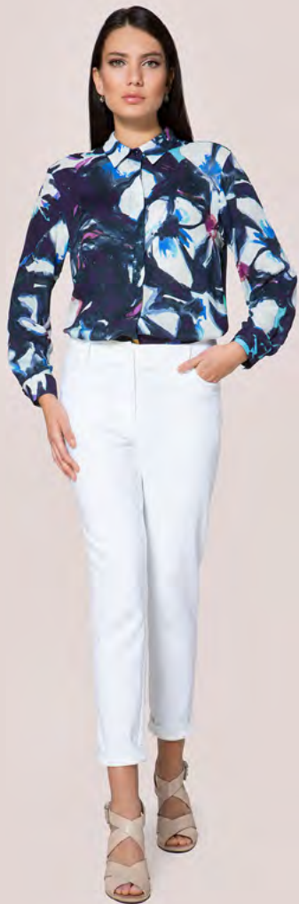
Shirt | 16-774/2 • 27 Trousers | 16-725 • 9