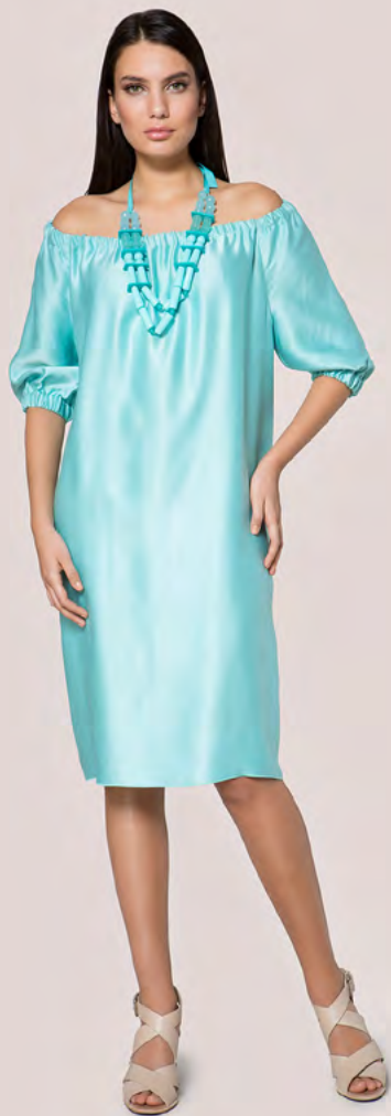
Dress 16-709 •