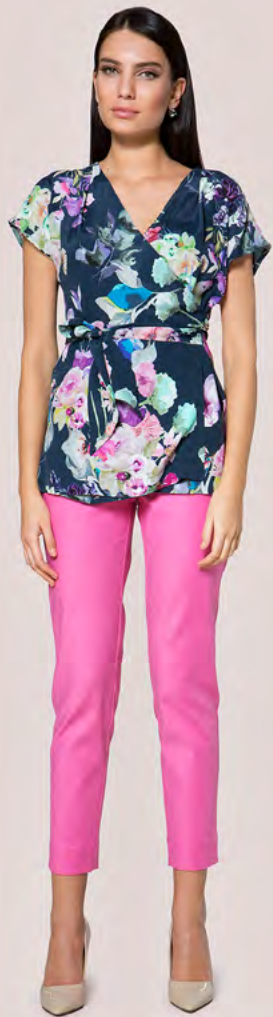
Tunic | 16-751 • 3 Trousers | 16-725 • 5