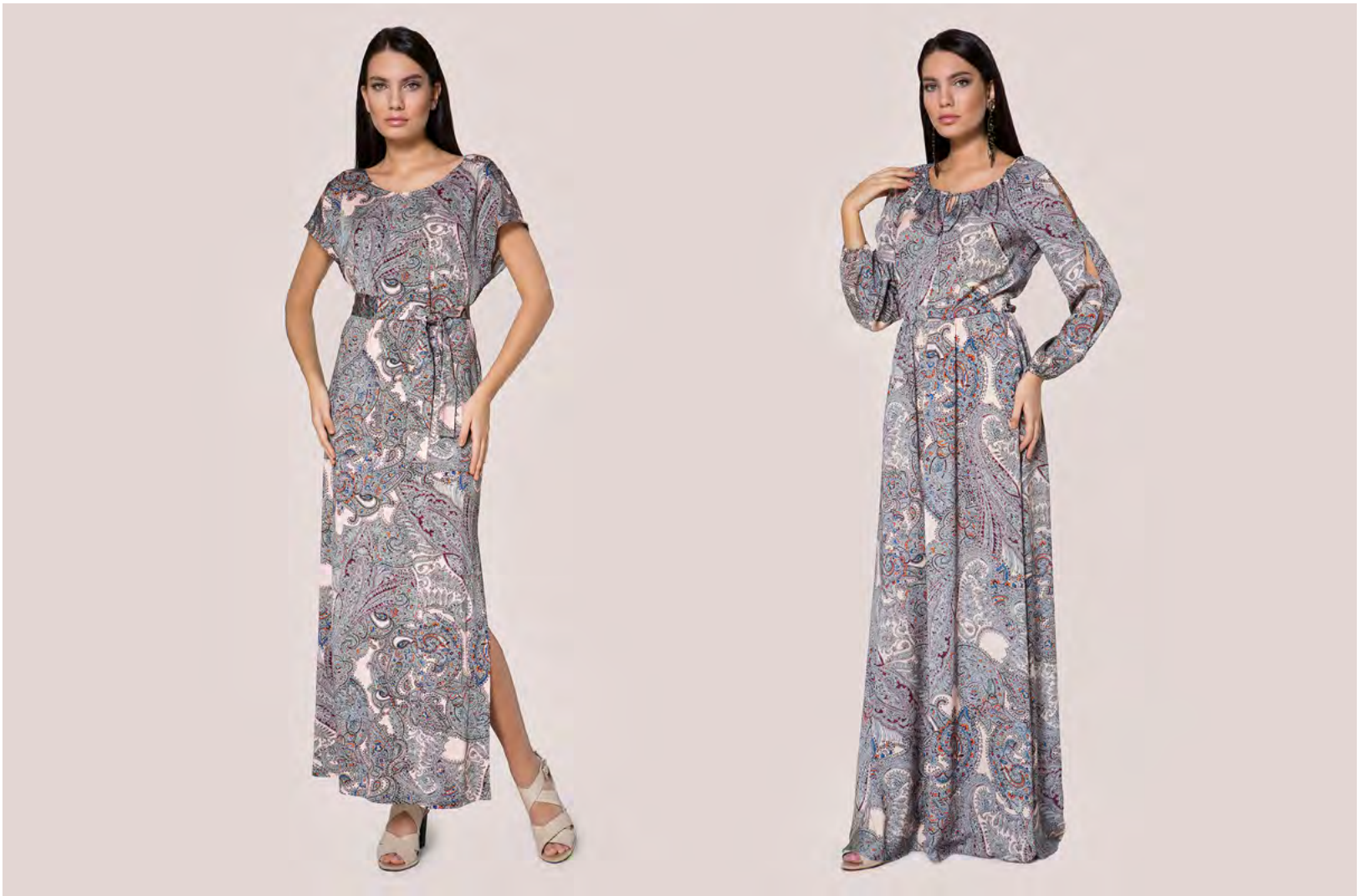
Dress | 16-729/2 • 25