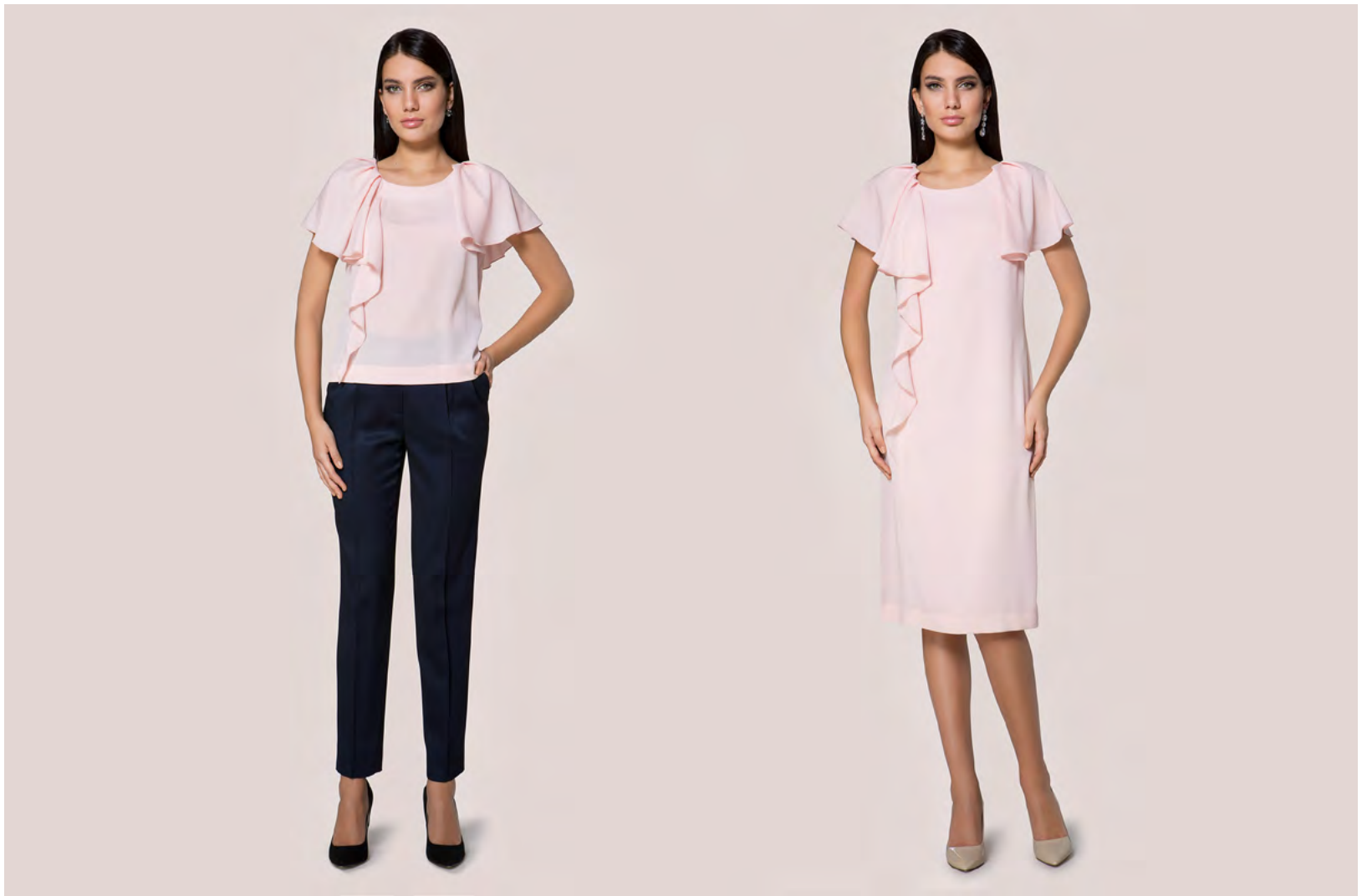
Blouse | 16-713 • 15 Skirt | 16-765 • 13