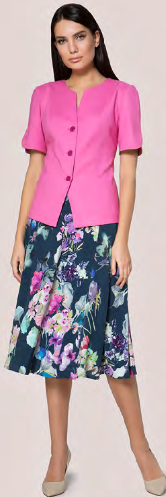
Jacket | 16-722 • 5 Skirt | 16-724 • 3