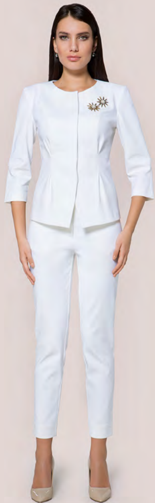
Jacket 16-754 • 9 Trousers 16-725 • 9