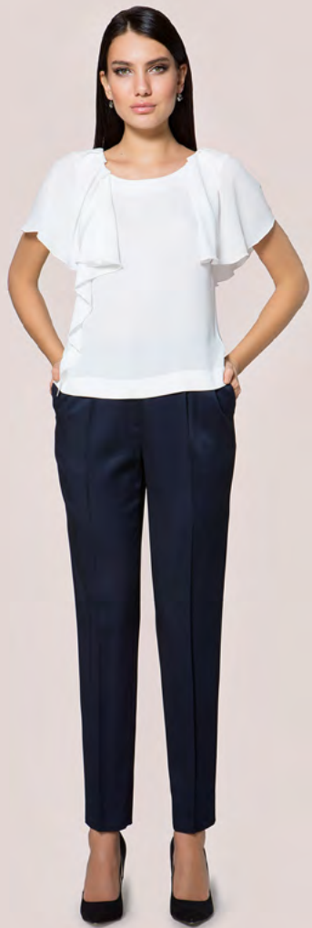
Blouse 16-713/2 • 16 Trousers 16-765 • 13