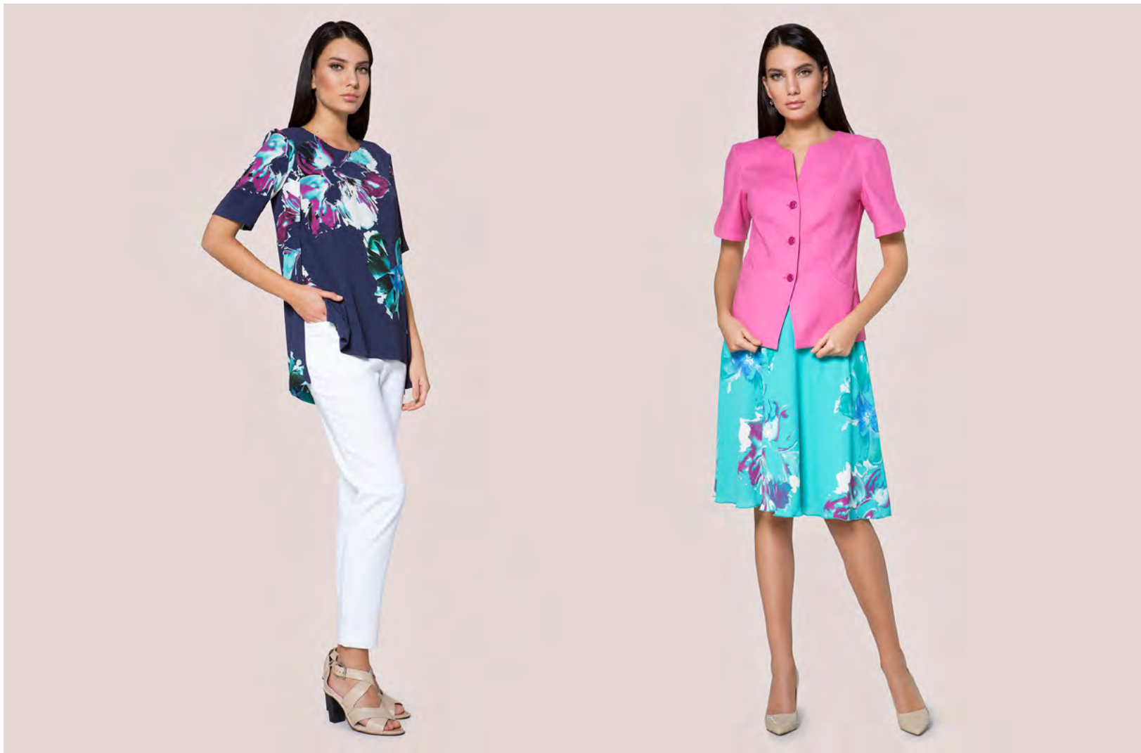
Tunic | 16-772 • 22 Trousers | 16-725 • 9