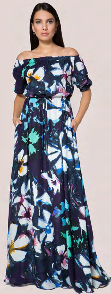
Dress | 16-779/2 • 27