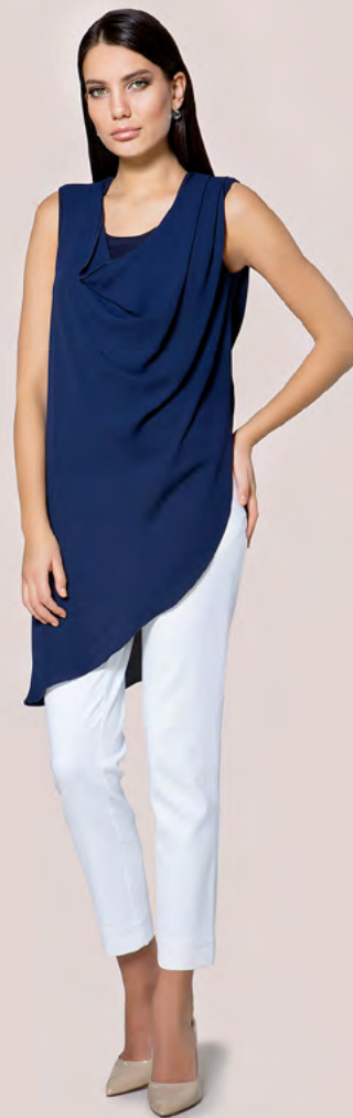
Tunic 16-762 • 18 Trousers 16-725 • 9