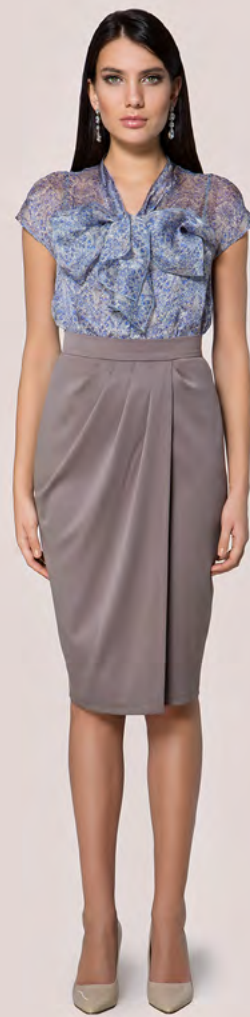
Blouse 16-733 • Skirt 16-763 • 12