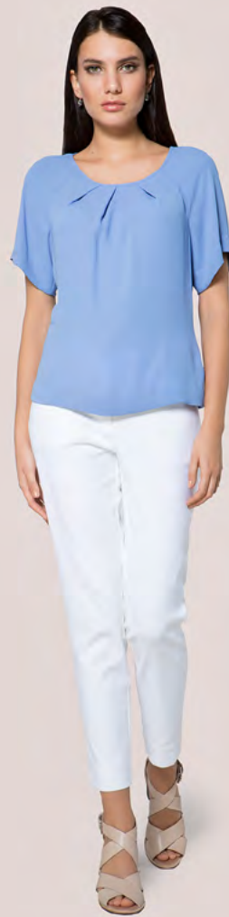
Blouse 16-701 • 17 Trousers 16-725 • 9