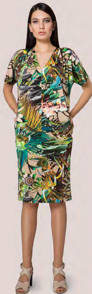
Dress 16-769 • 26