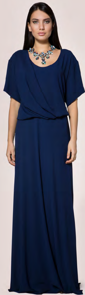
Tunic 16-712 • 18 Trousers 16-755 • 18