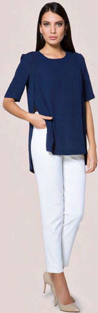
Tunic 16-772 • 18 Trousers 16-725 • 9