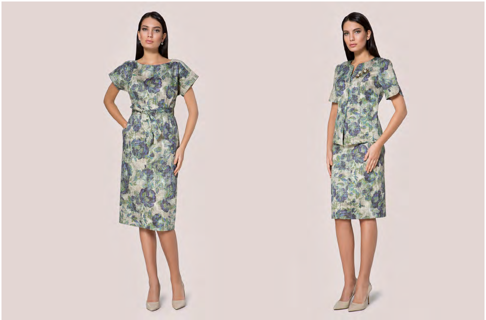
Dress | 16-731 • 2