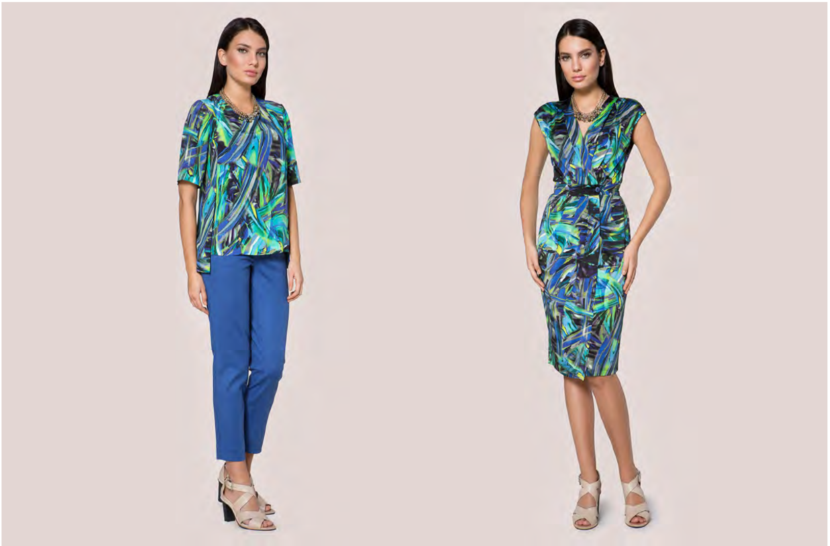
Tunic 16-749 • 23 Trousers 16-725 • 6