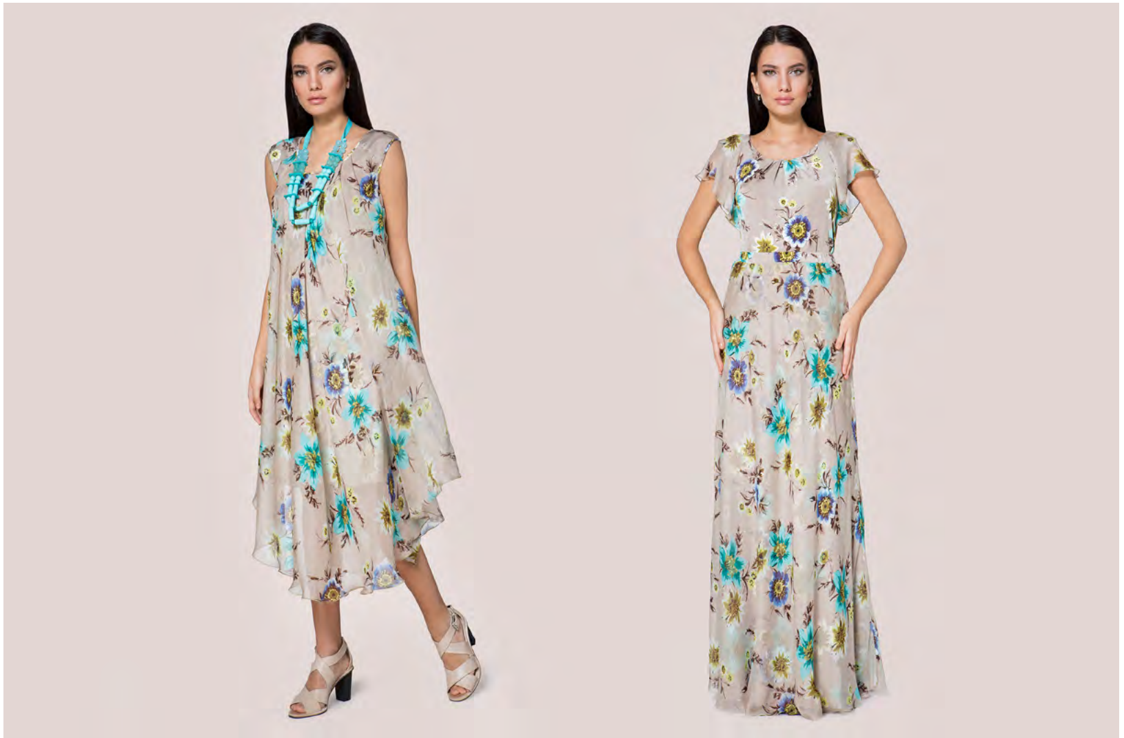
Dress 16-707 • 35