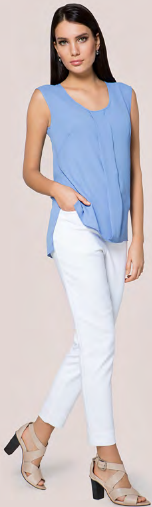
Top 16-761 • 17 Trousers 16-725 • 9