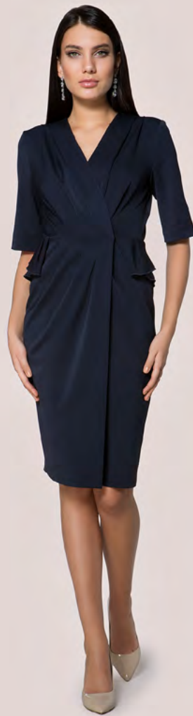
Dress | 16-703 • 13