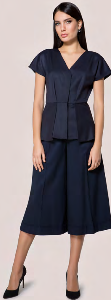
Jacket 16-746 • 13 Culottes 16-739 •