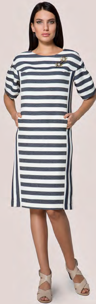
Dress 16-775 • 11