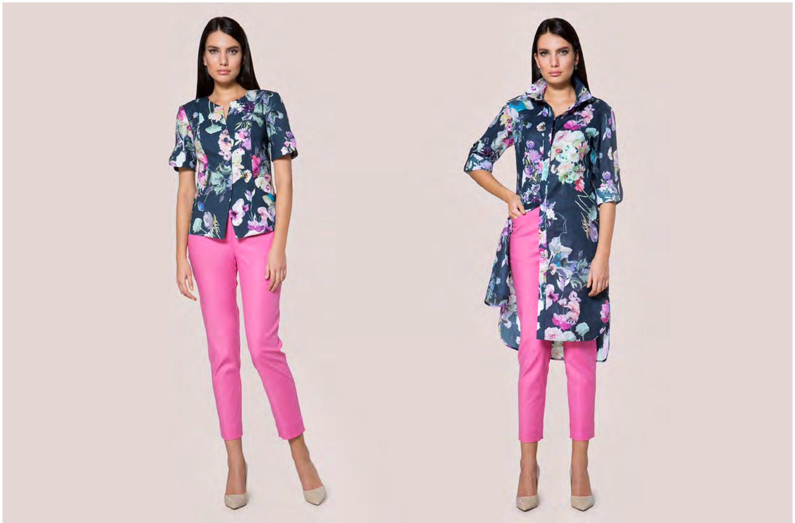
Jacket 16-722/2 • 3 Trousers 16-725 • 5