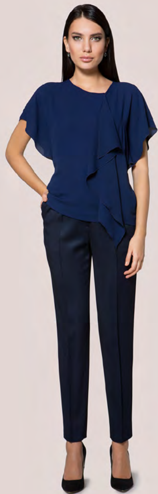
Blouse 16-742/2 • 18 Trousers 16-765 • 13