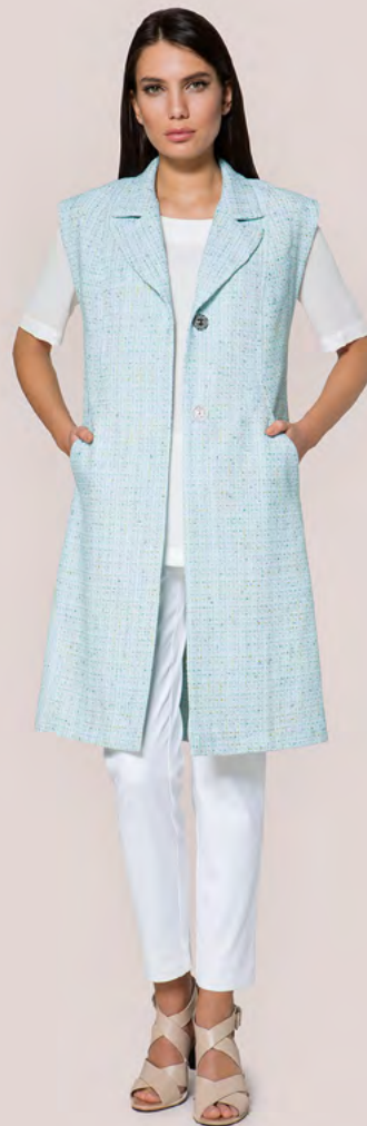
Vest 16-748 • 32 Tunic 16-772 • 16 Trousers 16-725 • 9