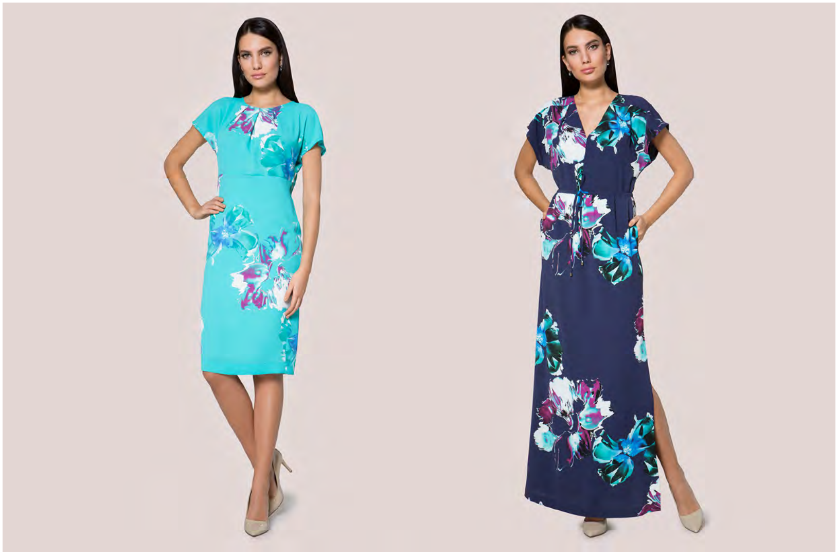
Dress | 16-757 • 21