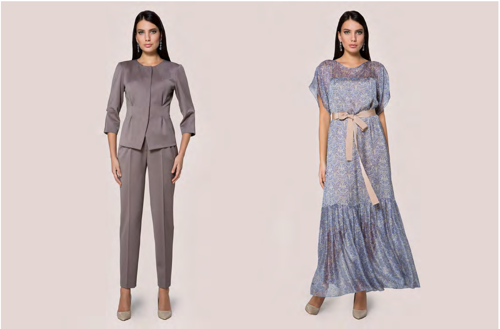
Jacket 16-754 • 12 Trousers 16-765 • 12