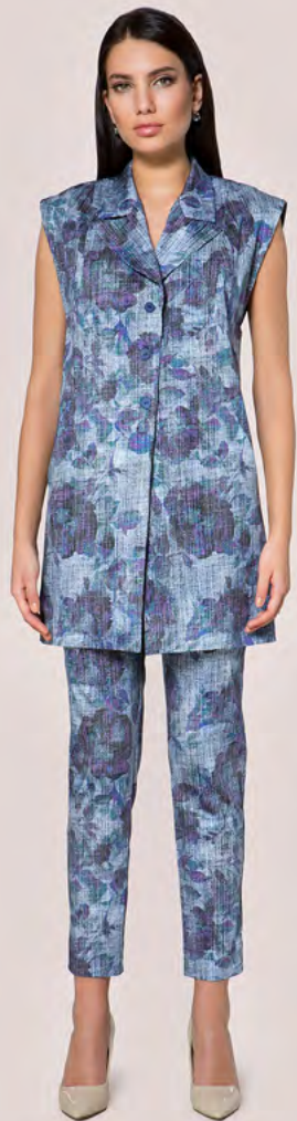
Vest 16-727 • 1 Trousers 16-725/2 • 1