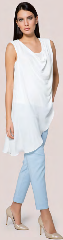
Tunic 16-762 • 16 Trousers 16-625 • 7