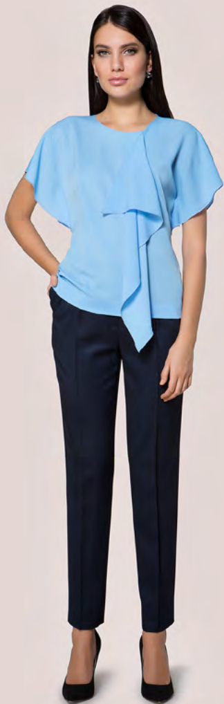
Blouse | 16-742 • 39 Trousers | 16-765 • 13