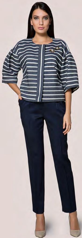
Jacket 16-720 • 10 Trousers 16-765 • 13