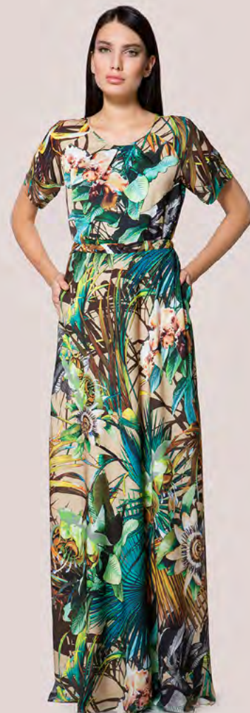
Blouse | 16-701/2 • 26 Skirt | 16-755/2 • 26