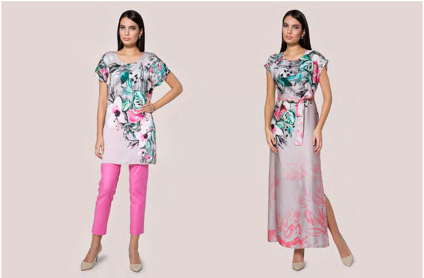
Tunic | 16-715 • 31 Trousers | 16-725 • 5