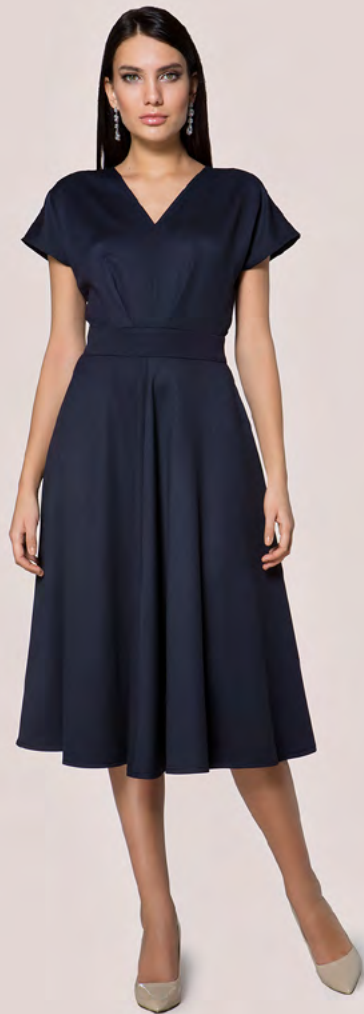
Dress | 16-706 • 13