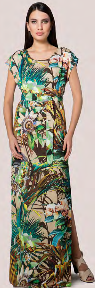
Dress | 16-729 • 26